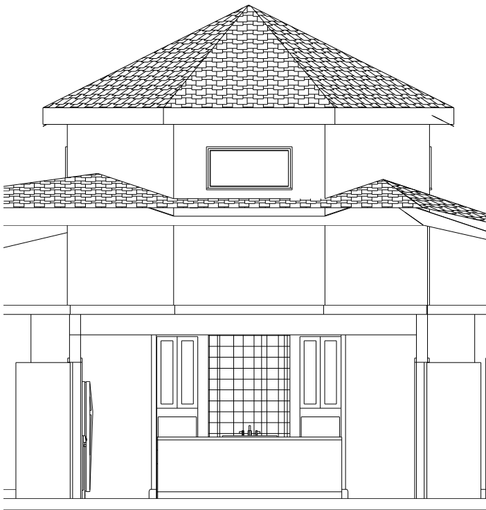
Tower elevation from front